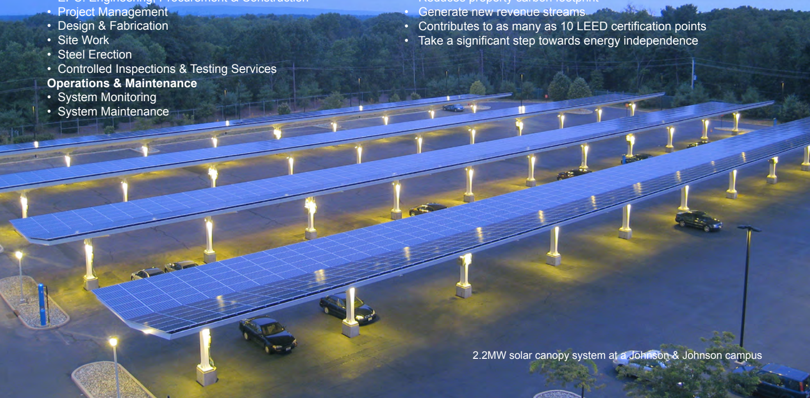
2.2MW solar canopy system at a Johnson & Johnson campus