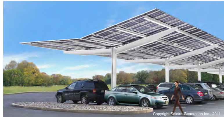
The Solaire 360 I+E