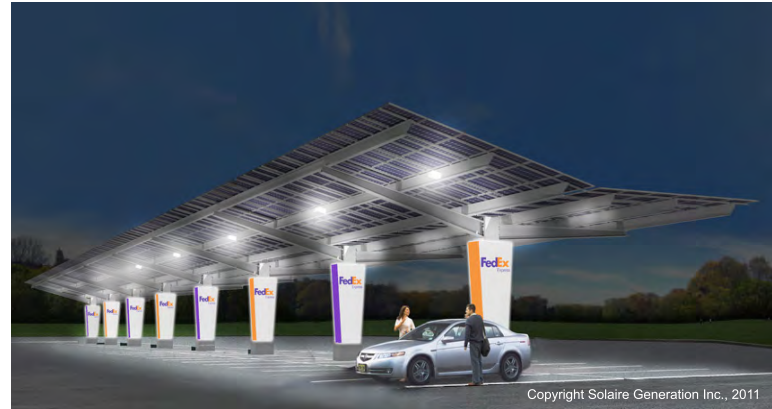
Branding / Advertisement