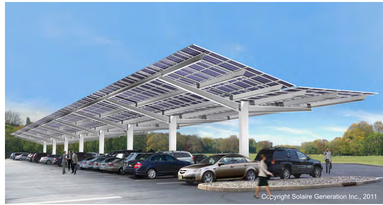
The Solaire 360 T+F

The Premium™ offers optional rain water harvest for gray water use.