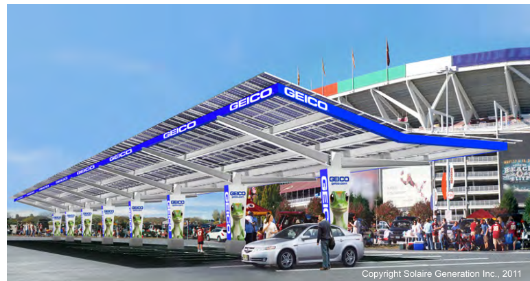
Branding / Advertisement

SOLAIRE™ GENERATION DESIGN FABRICATE INSTALL